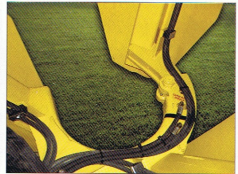
New "Round Frame" for Models 240i and 280i