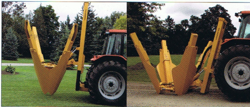
Dutchman Lift-Mast Assembly for mounting a Tree Spade to rear of any tractor.