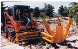
Side-swing Models also available!