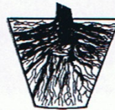
"Dutchman Truncated Spade" Ideal for hearty rooted systems.