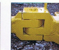
vs. New-Style Gate-Hinge

The new Dutchman Gate-Hinge carries a 2 1/4" pin, hardened steel spacers, and aluminum bronze bushings in a "finger-joint" design. It has over double the surface area of the competition and virtually eliminates soil getting into the gate housing.